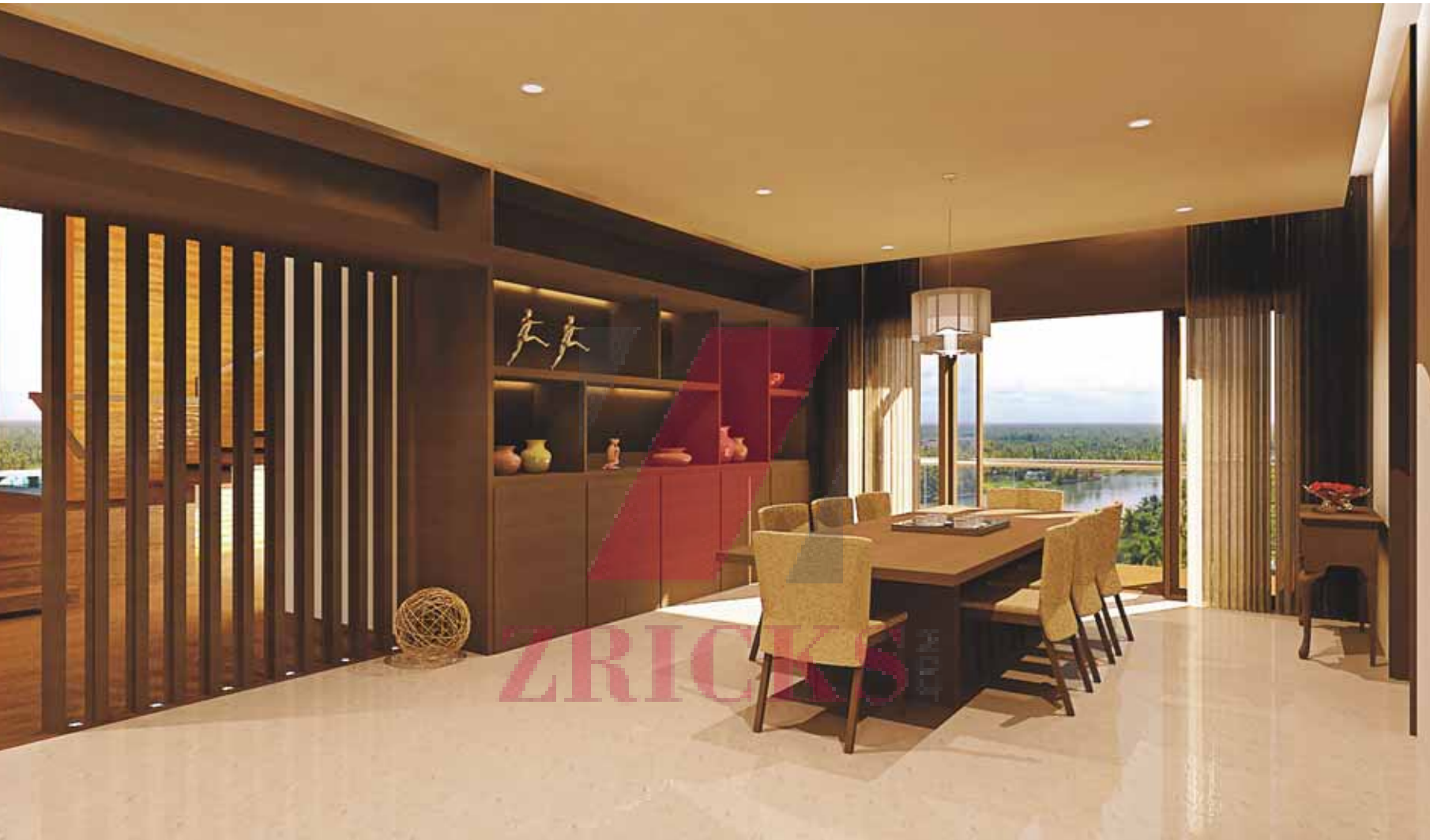
Dining room: 4400 x 6875 mm/ 14'5" x 22'5"

The six thousand square feet centrally air conditioned duplex apartment is fitted out with the best that money can buy. Premium Italian marble, timber and wooden floor finishes under double height spaces extend the feeling of spaciousness about you.