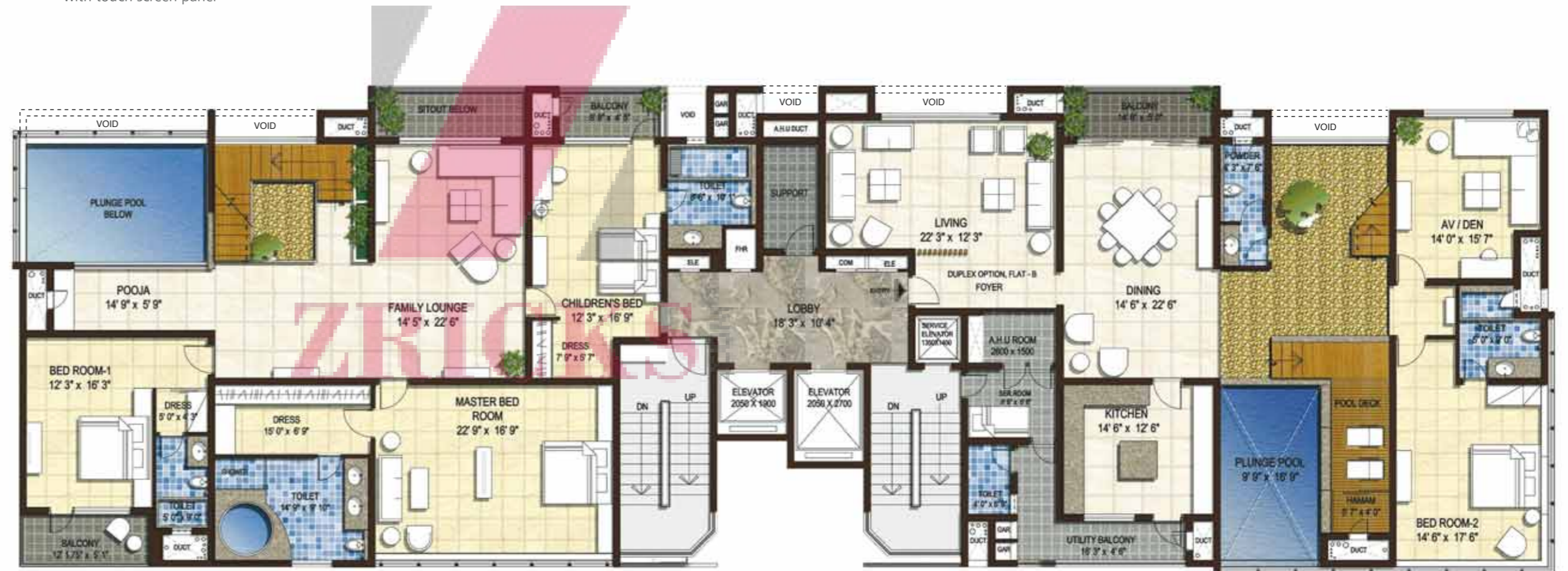
Type A (Upper level)