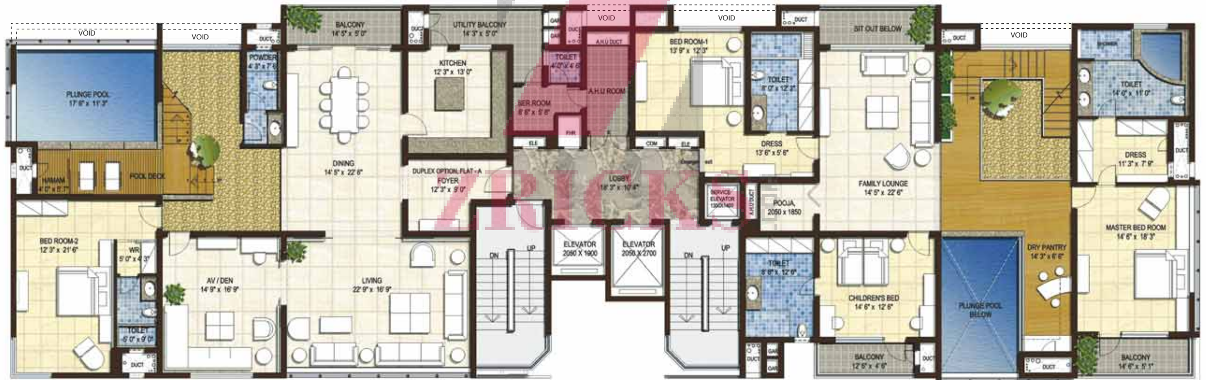
Type A (Lower level)